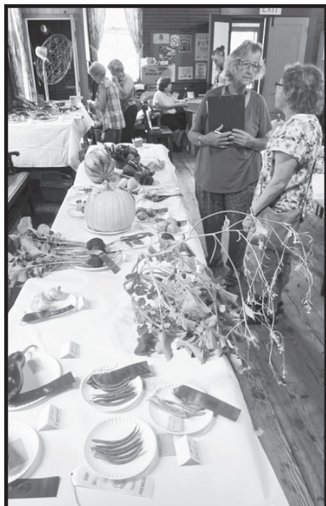
Some of the many entries at the Granby Grange Fair in Sept.