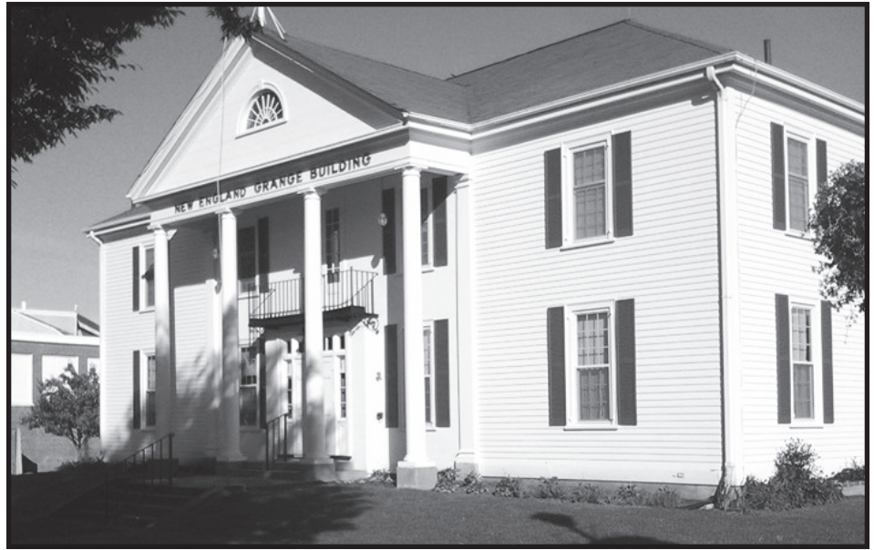
The New England Grange Building at the Big E.

Editor's Note: For those not familiar with the Big E, the six New England Grange States own their