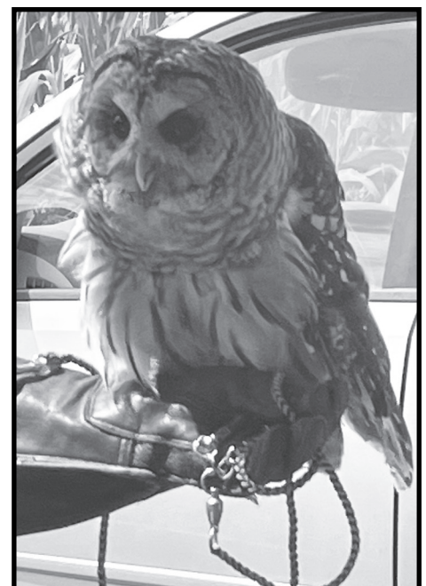
Albert the Owl

Join us at 6:00pm for a social hour before the film. Community members are now bringing food to share which will include a Tex-Mex casserole, Beaver Lodge cookies, shrimp, cheese, crackers, grapes and more! Next meeting - Oct 26th at 7:00pm