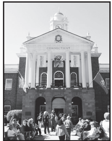
The Connecticut Building

One of the most enduring and beloved examples of New England regionalism is the annual Eastern States Exposition fair, colloquially known as "The Big E." Whereas most other states in the U.S. feature their own state fairs in the summer or fall seasons, the Big E represents all six New England states in one giant, multi-week event that ranks among America's largest annual fairs, both in size and attendance. First held in 1916, the Eastern States Exposition began as a showcase of agricultural innovation with the hopes of encouraging young people to work in farm-related careers. Today, over 100 years later,