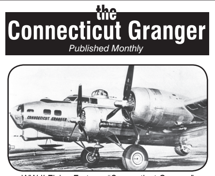
WW II Flying Fortress "Connecticut Granger"

Another important matter regarding the meeting forms taken by various Granges, varying from