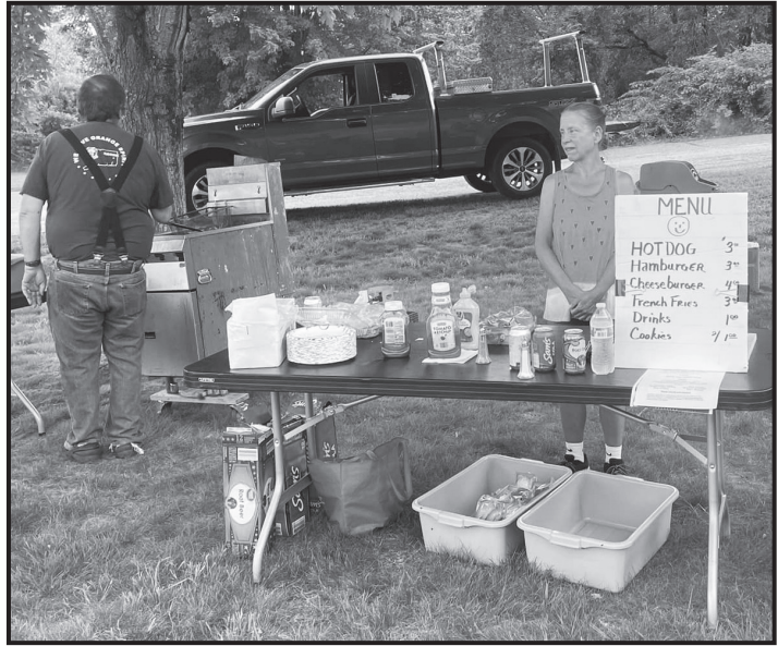
{\sf EkonkGrangefoodboothat} the {\sf SterlingSummerConcert}.