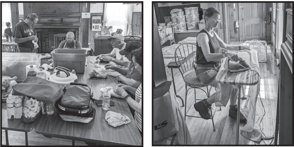
Board of Trusttee members and volunteers were hard at work on July 23rd. After cleaning the building, they sorted last year's craft inventory. They also generously accepted the challenge to sit and mark the new items that were brought in. It's a job much to big for only a couple of people. Job Well Done! Stay tuned for our next day which will be setting up the craft side of the building and of course marking new items. — Dawn Percoski