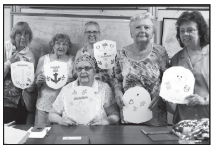
Family crests made by Vernon Grange members.