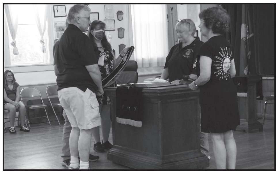
Members of Taghhannuck Grange traveled to Stanford Grange #202 (NY- Dutchess County) to help install their new members on July 11.

Come one, come all to the 2023 Winchester Grange Fair & Community Tag Sale at the Grange Hall and the Green in Winchester Center. Spaces in the tag sale are free and available on a first come, first served basis. We will also have our judgings of fruits, vegetables, and baked goods along with a chance table, book sale and food all day from