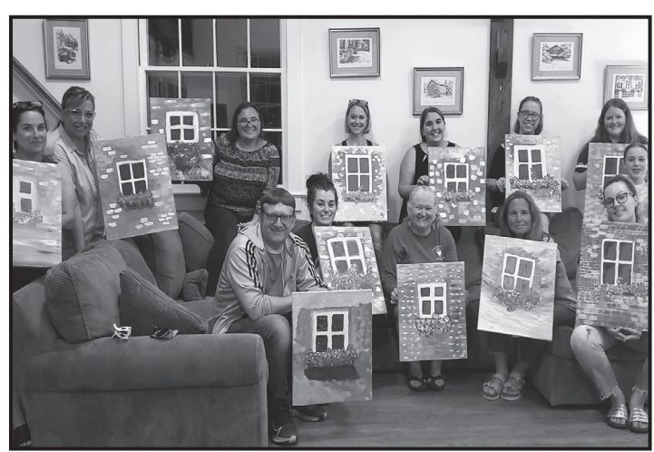
Norfield Grange held a Paint & Pizza event.