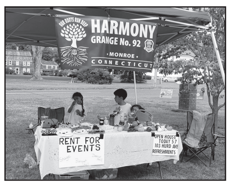
Harmony Grange exhibited at the local Farmer's market.