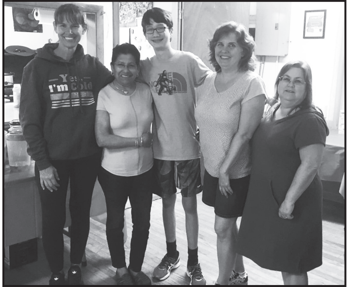
Hillstown Grange welcomed three new members.