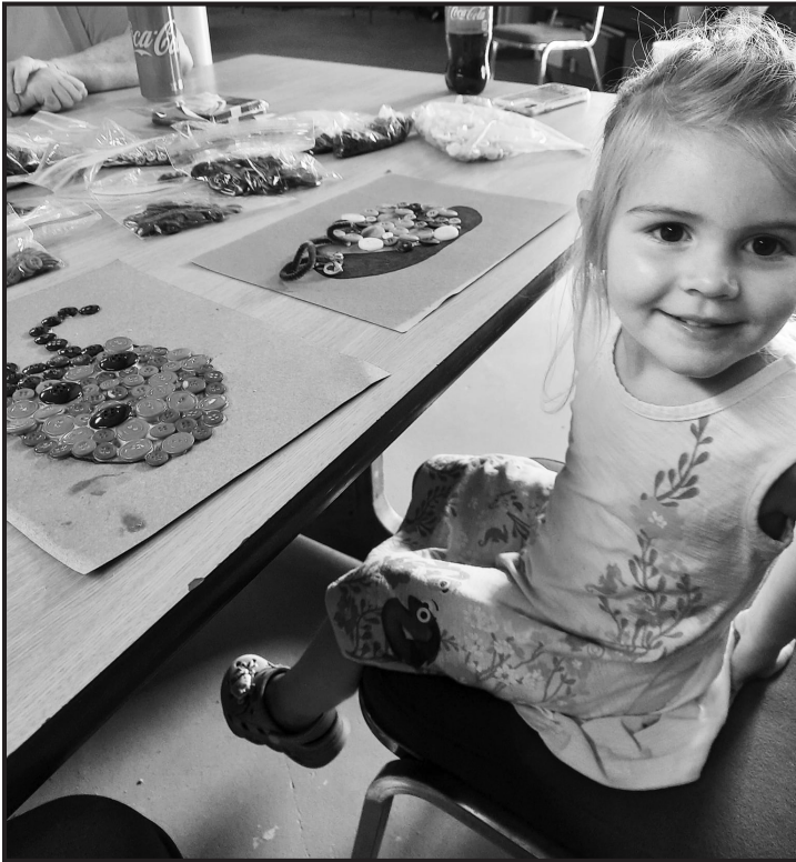
A young fair-goer shows off her button art at the Senexet Grange Fair on Aug. 21 in Woodstock.