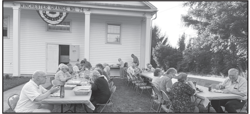
Winchester Grange members and guests enjoy a picnic at the hall in August.

Interest in the Flea Market has waned over the years so it was decided to go in a different direction this year. We held our first Community Tag Sale on the Green.