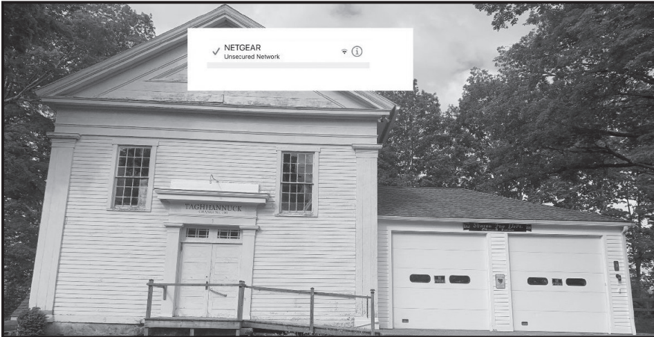
Taghannuck Grange Hall in Sharon, CT