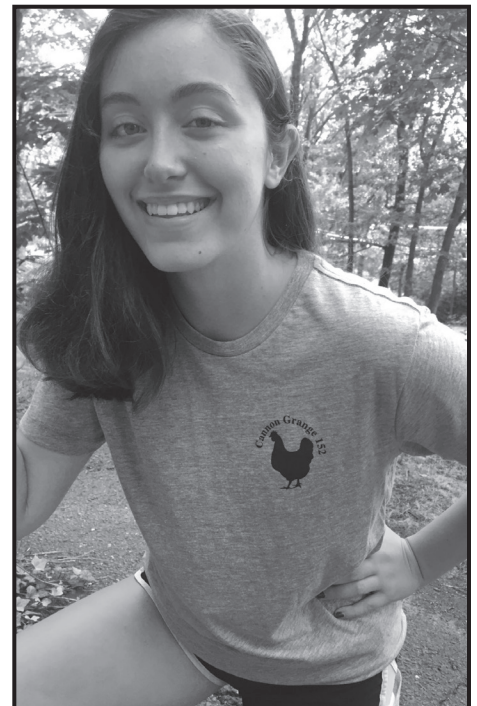
Images from the Cannon Grange Fair, held on August 29. One of their members models their new Grange T-Shirts that premiered at the Fair.