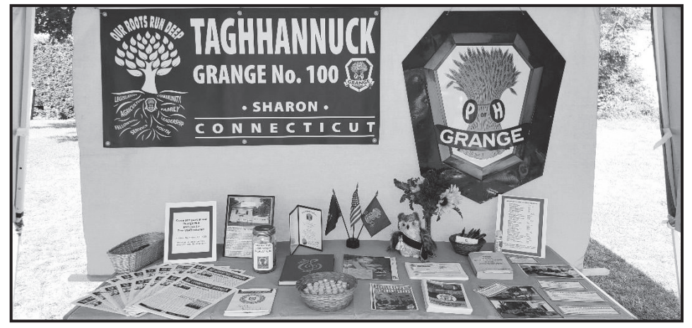
Taghhannuck Grange's booth at the Cornwall Ag. Fair on Sept. 11.

Winchester Grange was pleased to serve as host for the Degree Day organized by Mountain Laurel