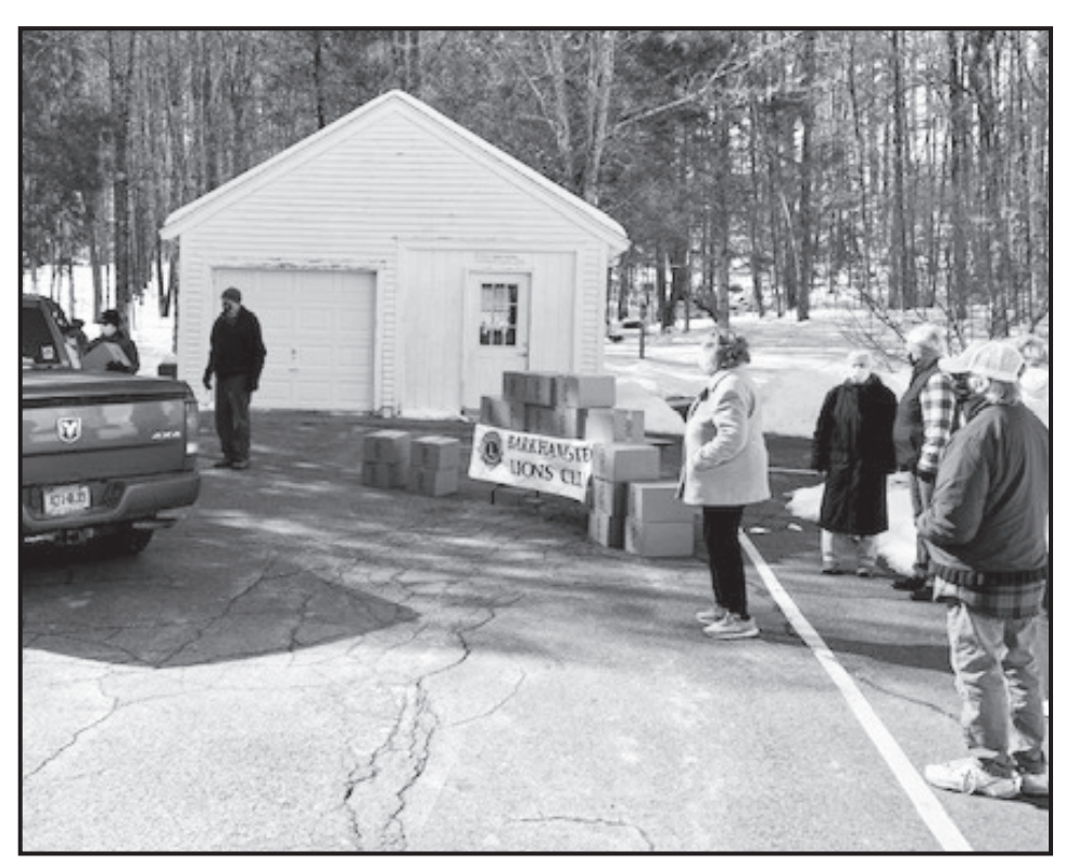
1,500 pounds of food were distributed to Barkhamsted residents.