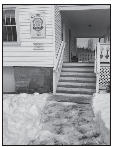
Top- Peanut Butter for Puppies collection box. Above- Riverton Grange Hall.