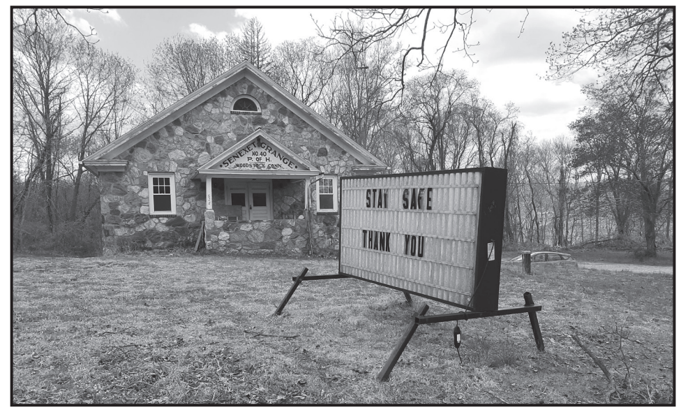
Senexet Grange #40 (Woodstock) placed a sign in front of their Grange hall saying "Stay Safe - Thank You"

Want to keep up with the latest news? Just follow the link to my Facebook page, and then click the "Like" button once you are on the page to see our updates in your FB timeline. http://www.Facebook.com/CTGrangeHanktheBurro