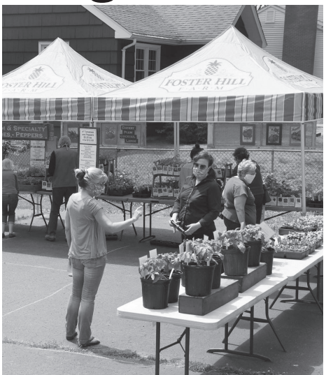
Hillstown Grange held a "Social Distancing" version of their annual Plant Sale in May. More on this event inside.

The Connecticut State Grange Agriculture Committee is setting up an outreach project to purchase masks for agricultural workers in our state. This will be a joint project of the Ag. committee and