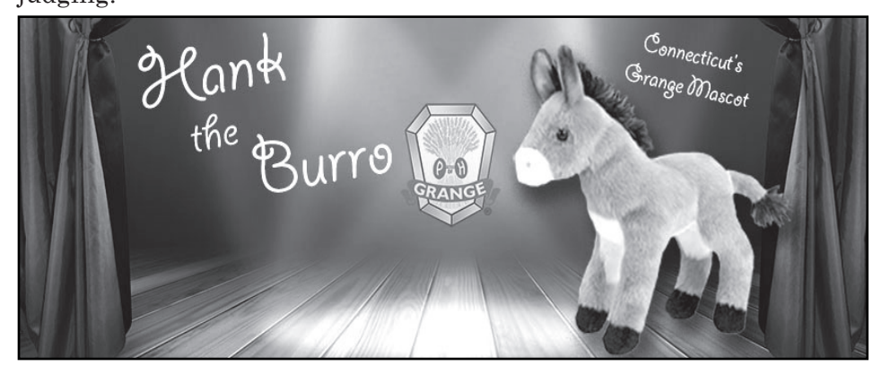
Hello Grange friends!

Conditions and regulations are constantly evolving from day to day. Stay informed following the recommendations and requirements of the local, state and Federal governments and the Centers for Disease Control (CDC). The State Grange will make you aware of any and all new information as it becomes available.