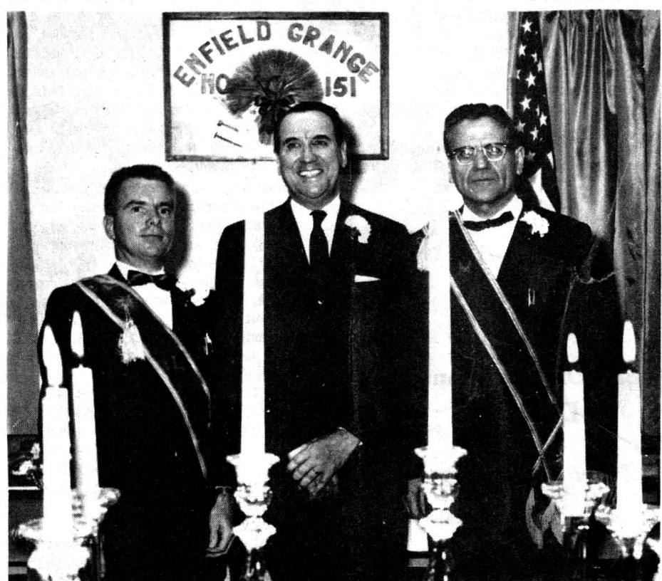
Enfield Grange #151 recently completed their new Grange Hall Building and were honored to have Governor John Dempsey as principle speaker during the impressive Dedication Ceremonies.